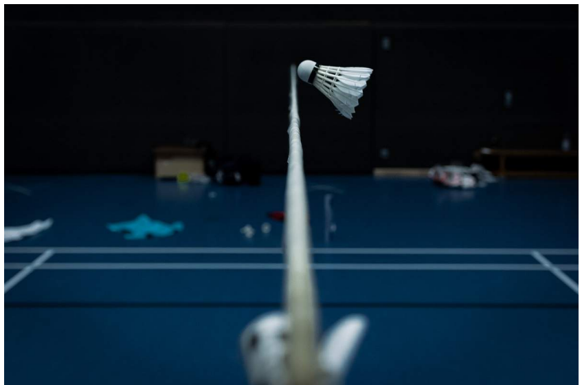
Chinese community groups often centre on popular pastimes or on groups such as senior citizens

But the survey also found that there is limited engagement with Chinese community organisations. Very few people surveyed expressed an interest in joining community groups, or said they found them useful in making their way in society. This limited interaction between ordinary Chinese-Australians and community organisations was confirmed in the numbers: only 25 per cent of Chinese-Australians reported regular contact with such an organisation in the past 12 months. 60 In other words, the loudest voices in community organisations may be unrepresentative of the community or, at the very least, not speaking with their broad authority.