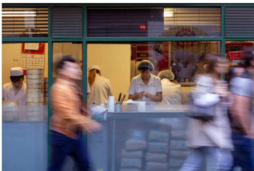
The Chinese-Australian migrant community fills a variety of professions, and runs businesses, big and small.

community organisations in Australia and the CCP's united front, a sprawling network of groups and individuals who aim to shape discourse and decision-making in Beijing's favour. 12 Rather than revisit the activities of the united front, this report seeks to better understand Chinese community organisations in Australia and the way they relate to the national debate about China. The Lowy Institute conducted a series of focus groups among Chinese-Australian communities and 30 in-depth interviews with Chinese-Australian community leaders between November 2020 and April 2021. 13