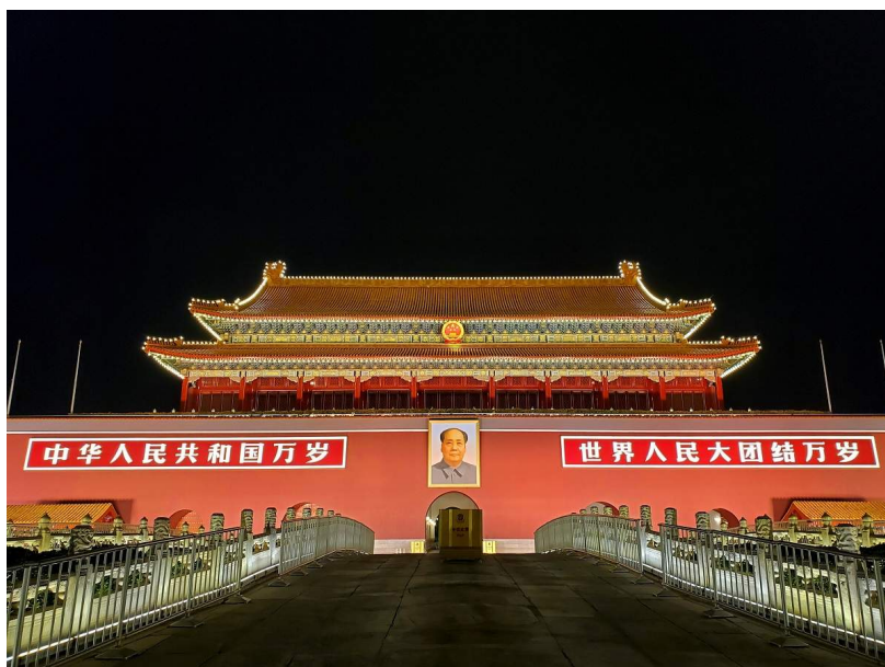
After the Tiananmen Square massacre in 1989, the Australian government issued 42 000 permanent residency visas to Chinese students studying in Australia.

Chinese community organisations can broadly be divided into two streams depending on the year of establishment: prior to 2000, and after 2000. During the 1980s and 1990s, newly arrived Chinese-Australians formed organisations to help with integration. This wave was largely in response to the final dismantling of Australia's discriminatory migration policies in the 1970s. Numbers were boosted by the issuing of permanent residency visas to 42 000 Chinese students studying in Australia in the aftermath of the Tiananmen Square massacre in 1989. These organisations were shaped by the nature of Australia's multicultural and welfare delivery policies. 19